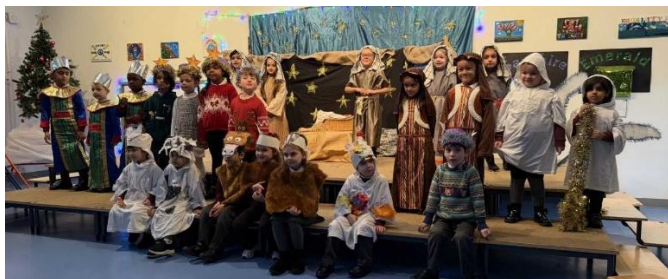
Snuggle up Stable

What a busy, brilliant week in school! The Nativity performed by Banyan Class on Wednesday was a particular highlight and a reminder that this time of year is a celebration of kindness and connection.